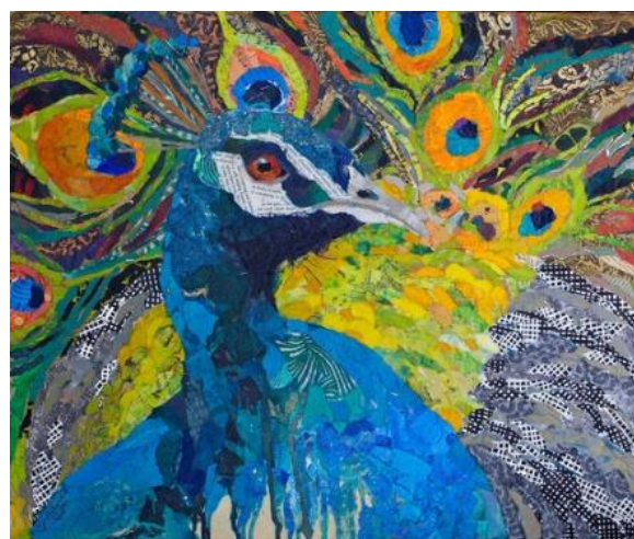
"Poised Peacock #1"